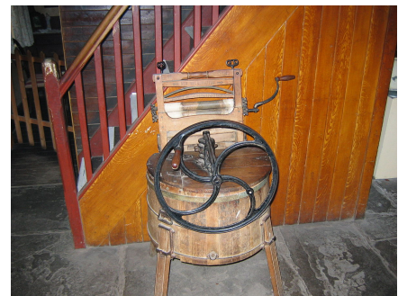
19th-century Metropolitan washing machine

By 1940, 60% of the 25,000,000 wired homes in the United States had an electric washing machine. Many of these machines featured a power wringer, although built-in spin dryers were not uncommon.