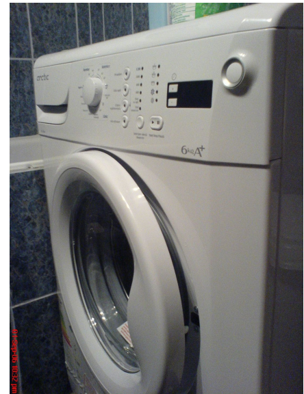
Arctic BE1200A+ is a front loading budget model sold in 2008 with 6 kg load, LCD indicator, 1200 RPM

This bellows assembly around the door is the source of problems for the consumer front-loader. The bellows has a large number of flexible folds to permit the tub to move separately from the door during the high speed extraction cycle. On many machines, these folds can collect lint, dirt, and moisture, resulting in mold and mildew growth and a foul odor. Some front-loading washer operating instructions say the bellows should be wiped down monthly with a strong bleach solution, while others offer a special freshening cycle where the machine is run empty with a strong