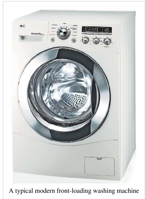
A typical modern front-loading washing machine

What is now referred to as an automatic washer was at one time referred to as a washer/extractor, which combines the features of these two devices into a single machine, plus the ability to fill and drain water by itself. It is possible to take this a step further, to also merge the automatic washing machine and clothes dryer into a single device, but