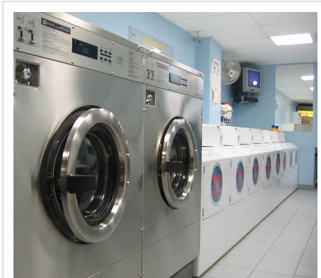
Commercial washing machines in a self-service laundromat

One special type of continuous-processing washer is known as the tunnel washer which does not have separate, distinct wash or rinse cycles, but combines them all in sequence inside a single long large-diameter rotating tube.