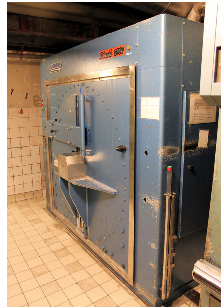
A 1980s Belgian 180kg load industrial washer in a Hotel in Brussels