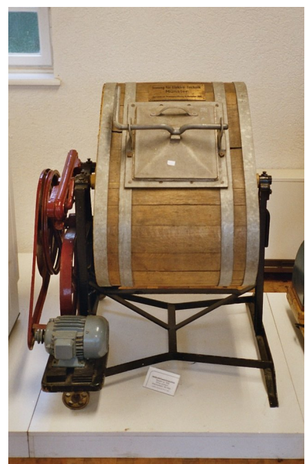
A vintage German model