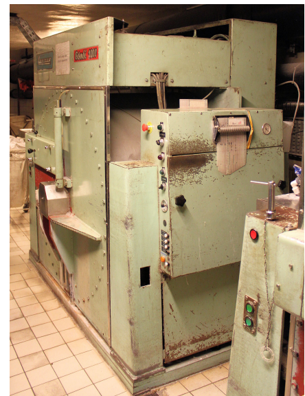
A 1980s Belgian 90kg load industrial washer