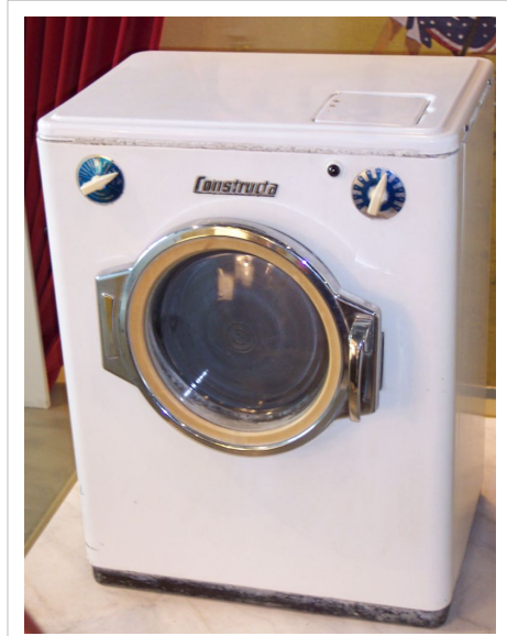
A 1950s model

Additionally some of the modern machines feature: